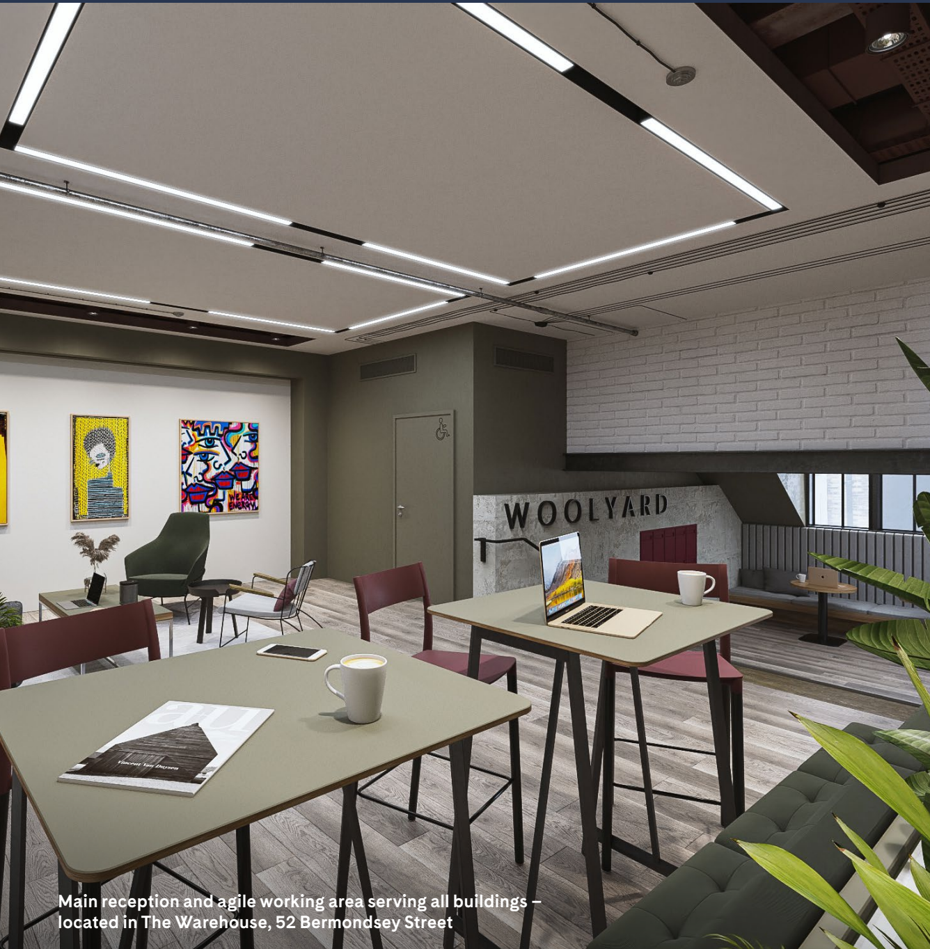
Main reception and agile working area serving all buildings – located in The Warehouse, 52 Bermondsey Street